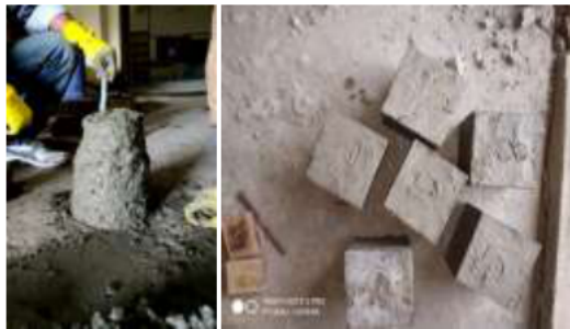
Figure 2 Fresh concrete slump and cubical specimens after 28day curing

The present work involved in casting of 36 cubical specimens of size (100 mm×100 mm ×100 mm) in total for both conventional and coconut shell concrete. The average compressive strength of 3 specimens were calculated for both 7 and 28 days strength for all the mixes. Workability test and the cast specimens are shown in figure 3.