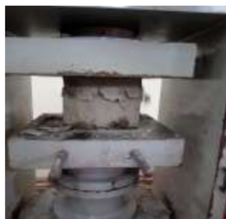
Figure 3 Compressive testing in CTM

After curing, the specimens were surface dried and tested under compressive load in CTM 3000kN capacity [18]. The failure of specimen is as shown in figure.