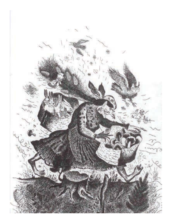
Illustration 2. Picture by Mensadyk Garipov. Obyda (Forest woman).

(albasty, shurale) (Rudenko 2006: 271; Khisamitdinova 2016: 108, 218), the Altaians and Teleuts (almis) (Dyrenkova 2012: 235); in the folklore of peoples inhabiting the Caucasus (Shemshedinov 1910: 152), as well as in Slavic (boginka, rusalka, lisunka) and Finno-Ugric traditions (ovda, vir'-ava) (Afanas"yev