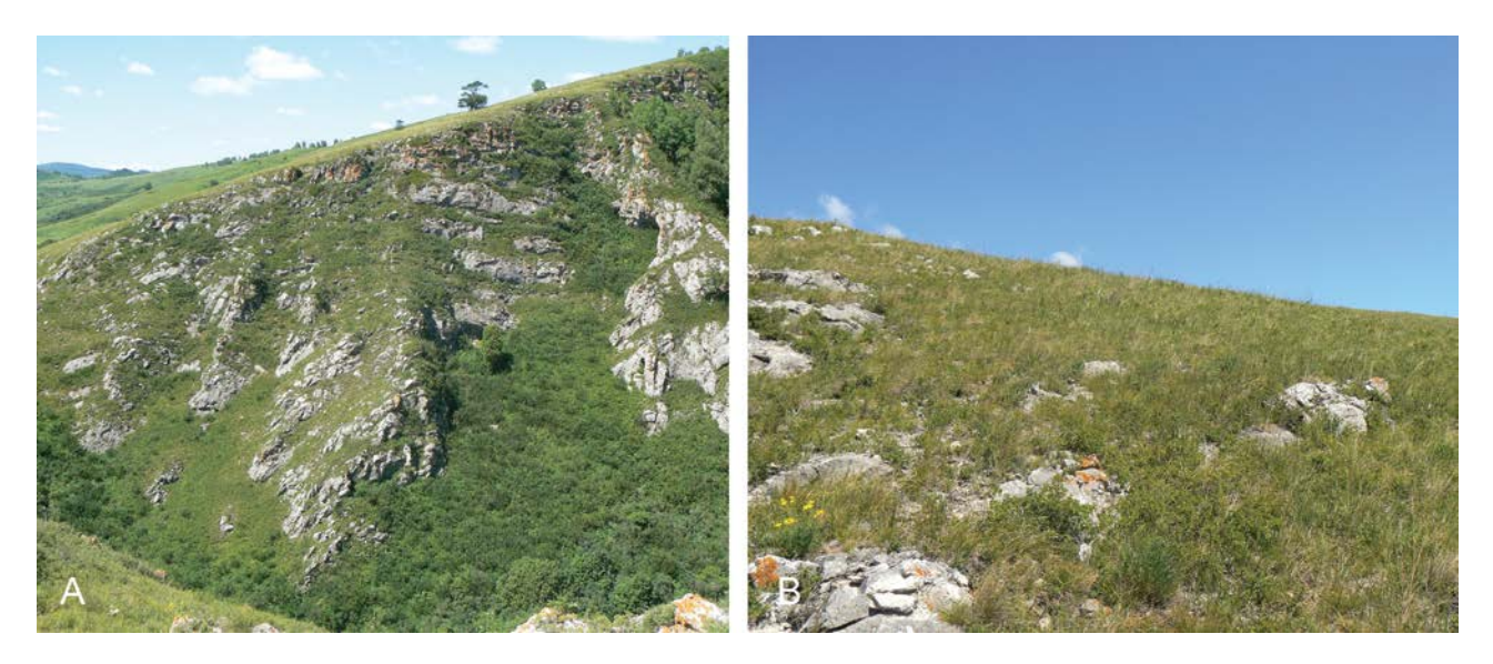
Fig. 2 – Habitats of Disciseda hyalothrix . A Dragunsky ravine. B Rocky (petrophytic) steppe on a hillside above the cave.

The terrain in the fungus area is typical for low mountains and is located in the mountainforest-steppe belt, with a combination of grass, mixed grass petrophytic and meadow steppes (Fig. 2). Shrub communities are well developed. They are widely represented in the steppes, and form a separate belt with thickets of Sibiraea laevigata , Caragana arborescens , Lonicera tatarica , Crataegus sanguinea , Sambucus sibirica along the pristine slopes and logs. Forest vegetation is represented by larch, birch-larch or pine forests on the tops of the northern slopes of the hills.