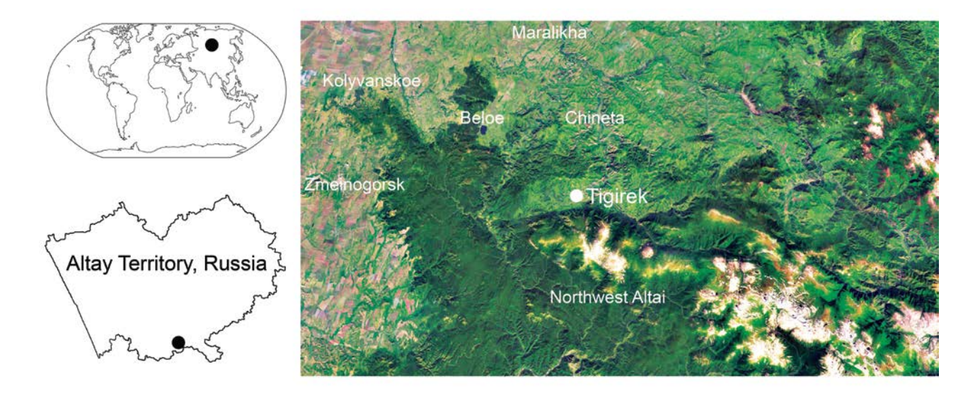
Fig. 1 – Map of the Altai Territory with the locality details of Disciseda hyalothrix (color drawing Google Earth Pro V 7.3 2019).

A rare species of D. hyalothrix was found in the Altai Territory, in the protection zone of the Tigirek Reserve, in the vicinity of the Tigirek village (Fig. 1). This is the first finding of this species in the Northern Asia.