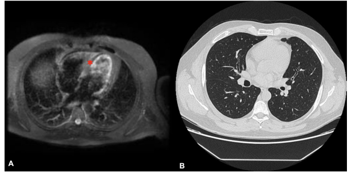
Figure 2. Cardiac magnetic resonance and thorax computed tomography examinations (CT) of the same patient. Subendocardial patchy contrast enhancement(asterix) is observed in the late contrast series on the left(A). Widespread involvement due to CO-VID-19 pneumonia on the right (B).