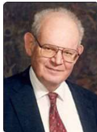
Benoit B. Mandelbrot

Ecole Polytechnique (Paris): 1947; Caltech: MS 1949; Université de Paris: Ph.D. in Mathematical Sciences 1952.