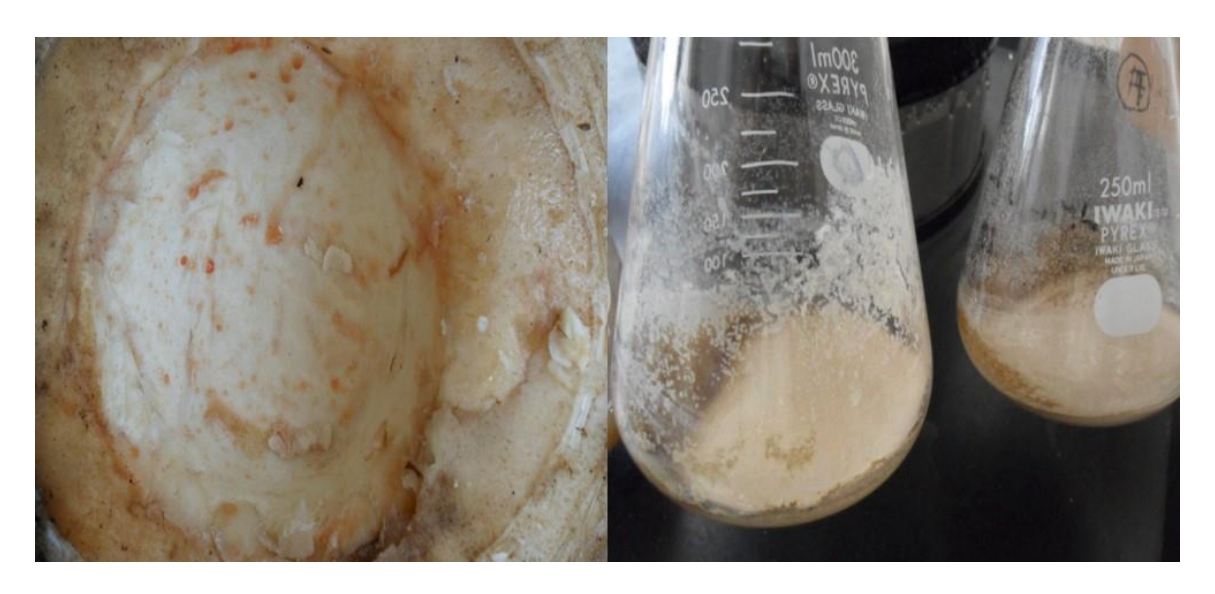
Figure 1. Freeze drying process of Ambonese banana stem sap.

*: Significant p-value<0.05. One-way Anova compare to control cell.