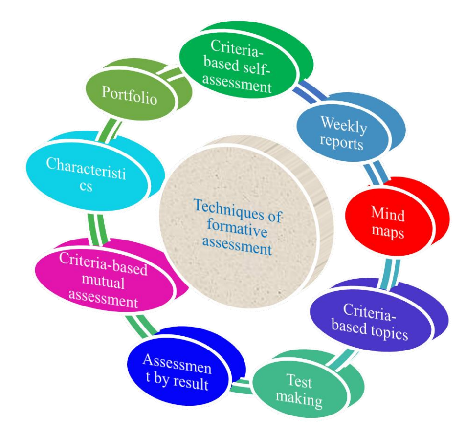
Figure 2. Formative assessment methods