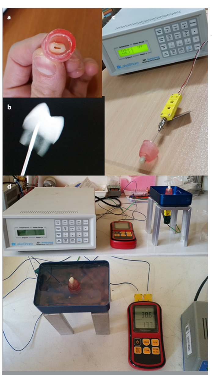
Figure 1. a-d. (a) Preparation of each tooth for the experiment. (b) Radiographical confirmation of the position of the thermocouple. (c, d) An in vitro experimental model for pulp temperature measurement

After preparation, the root of each tooth was cut apically at approximately 2-3 mm to the enamel-cement junction and perpendicular to the long axis, and the root channel was widened toward the pulp chamber (Figure 1a). The remaining pulp tissue in the pulp chamber was removed using an excavator and irrigated with NaOCI for 1 min. Then, the pulp chamber was irrigated with physiological saline. Teeth were kept in distilled water to avoid dehydration until the testing step (<1 month). Crowns were placed on their palatinal surfaces in molds containing silicone impression material (Siloflex® Putty; SpofaDental, Moscow) with the vestibular surface being exposed and facing upwards for measurement of microroughness. A 4×6 mm acrylic resin molding was made in the same diameter with the bracket to restrict the surface roughness measurement area to the bracket area in contact with the enamel. While the molding was on the tooth surface, surface roughness of the intact enamel on which a bracket has not yet been placed was