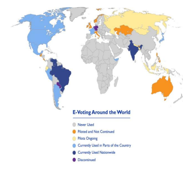
Figure1: Electronic voting and counting around the world [3]

voting. It is environmental-friendly and saves the cost of printing the papers.