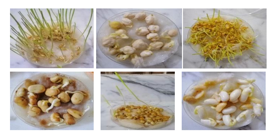
Fig.11. Result of growing seeds in petri dishes irrigation by treated wastewater

The cultivation of 6 kind seeds ( Vicia faba, Cicer arietinun, Phaseolus vulgaris, Triticum aestivum, Hordeum vulgare and Zea mays ) were done in Petri dishes and irrigated with treated wastewater and the effect of irrigation on the growth of the selected seeds was observed as change in the size of the seeds and became full and doubled in size and appearance of the stem-like from each seed also increase in length in each day. The rate of germination was about 80-90% in most laboratory seeds, germination speed was started in Triticum aestivum and Hordeum vulgare seeds after 3-4 days, followed by germination of other seeds ( Vicia faba, Cicer arietinun, Phaseolus vulgaris and Zea mays ) (Fig.11).