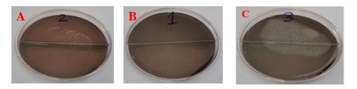
Fig.2. Isolates of treatment wastewater

This was done by using the Eosin Methylene Blue Agar. The cultivation applying with the same way in the identification of growing microbes (Fig.2).