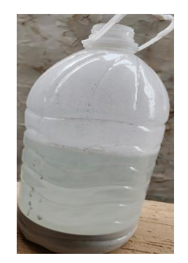
Fig.4. Sample of treated wastewater with using Lime