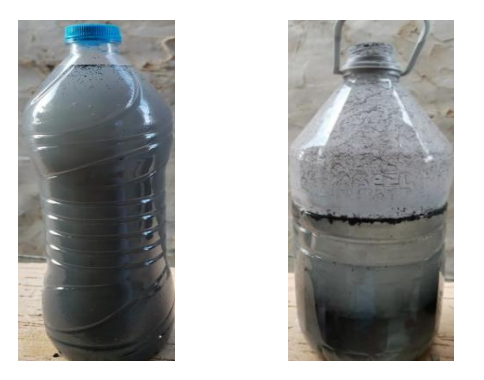
Fig.5. Sample of treated wastewater with using Lime and Charcoal

Half a kilogram (1/2 kg) of charcoal was mixed with half a kilogram (1/2 kg) of lime (calcium carbonate) and this mixture of materials was immersed in raw waste water and the treatment was carried out for a period of 7-8 days, every day the treated raw wastewater sample was filtered using filtration device and filter paper and replaced the amount of lime (Calcium Carbonate and Charcoal) that previously used (Fig.5).