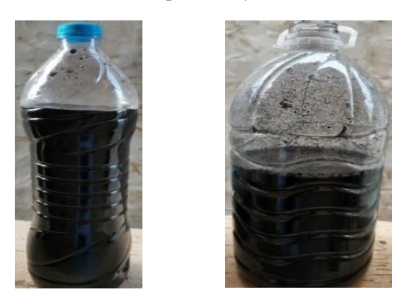
Fig.3. Sample of treated wastewater with using Charcoal

One kilogram (1 kg) from fragmentation and grinding charcoal was prepared, was carried out and placed in a sterile plastic container, then the wastewater sample was filtered using filtration device and filter paper to remove the suspended solids, then the charcoal was submerged with raw wastewater, the treatment process was done for wastewater for a period of 7-8 days, in each day the sample of treated wastewater is filtered with filtration device and filter paper and replaced amount of charcoal that previously used with new another quantity (Fig.3).