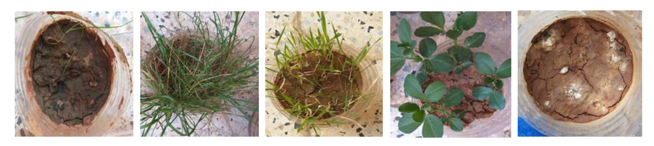
Fig.12. Result of growing seeds in the soil irrigation by raw wastewater