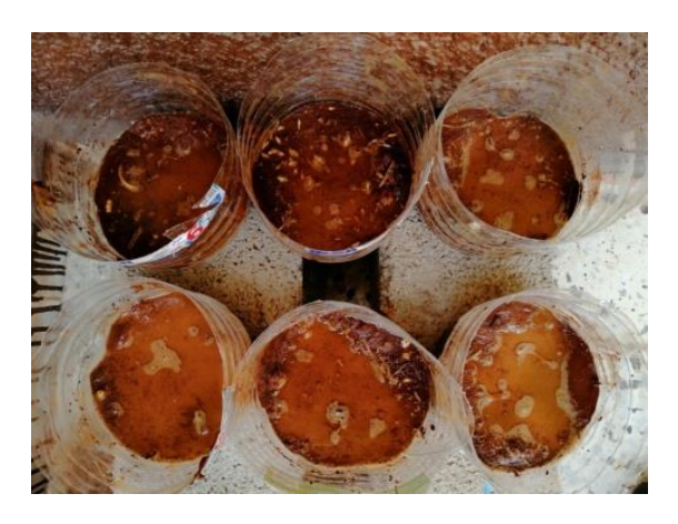
Fig.8. Germinated seeds in the soil irrigation by raw wastewater