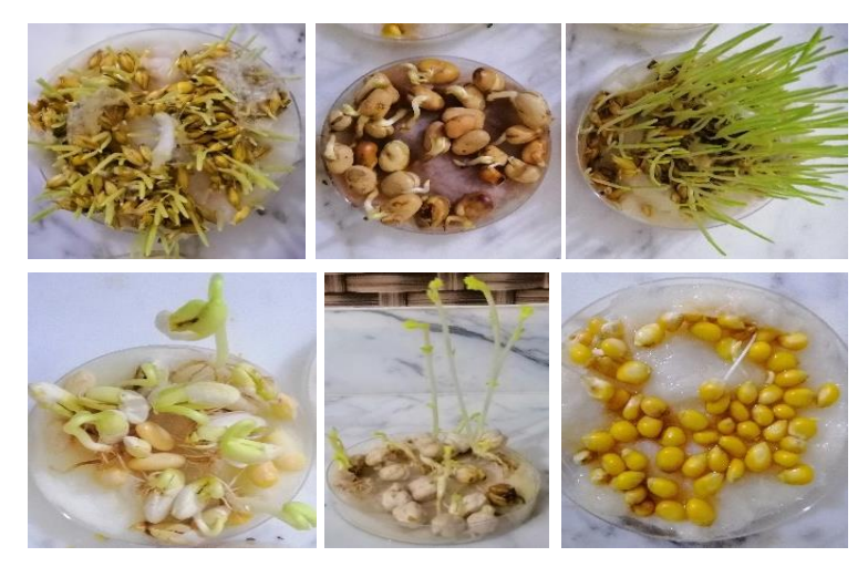
Fig.10. Result of growing seeds in petri dishes irrigation by raw wastewater

The cultivation of 6 kind seeds ( Vicia faba, Cicer arietinun, Phaseolus vulgaris, Triticum aestivum, Hordeum vulgare and Zea mays ) were done in Petri dishes and irrigation with raw wastewater and the effect of irrigation on