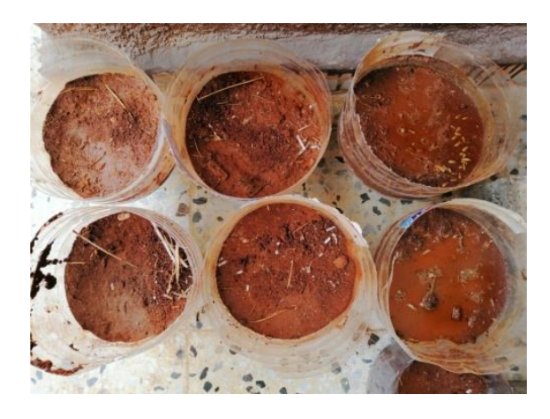
Fig.7. Germinated seeds in the soil irrigation by treated wastewater

Plastic pots were prepared and filled with soil and then prepared the selected 6 seeds (Beans, Chickpeas, Corn, broad bean, Barley and Wheat) were washed and sterilized by using a dilute chlorex solution with water and soaked for a minute and immediately washed with sterile distilled water and planted in the soil and irrigated it with treated wastewater, in addition to other seeds that were irrigated with raw wastewater, the plastic pots were kept at room temperature (20-25)°C, and the germination history and growth nature of each seed type were noted and recorded separately. The irrigation process with raw and treated wastewater was repeated every 2 days (Figs. 7-8).