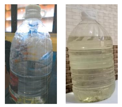
Fig.1. Sample of wastewater

Wastewater samples were collected randomly from two sites in Benghazi city (Al serty and Alkeish area) 50 liters were taken from raw wastewater resources and from storage basin. Samples were marked and kept in room temperature ( 25 \pm 2^{\circ} C) (Fig.1).