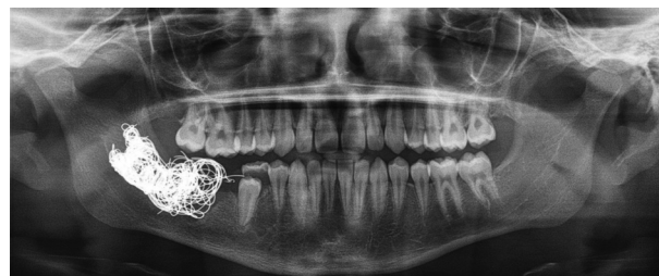
Fig. 3: OPG image 3 month after treatment. The image shows the presence of the material used for the vein embolization.

was extubated when the bleeding had completely stopped. He was discharged from the hospital 7 days after the procedure. In fact, a control arteriography performed 5 day after embolization showed a significant reduction of the size of the lesion. A MRI performed three months after the procedure evidenced the complete regression of the lesion. Furthermore, in a new control 18 month after the patient has no clinical signs of recurrence (Fig. 3). Hence, this approach could avoid an extremely mutilating surgery and severe psychological sequelae.