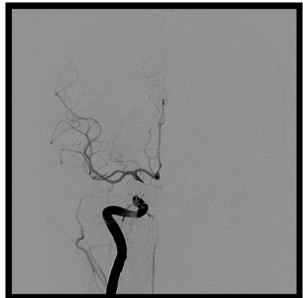
Fig. 2. AP head arteriography. CCF after treatment with endovascular approach.

completely disappeared after surgery. Moreover, the patient referred improvement of visual acuity. Importantly, we also want to emphasise that the patient remained asymptomatic after 9 years of clinical monitoring.