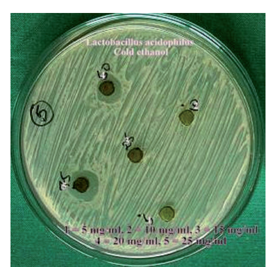
Fig. 3. Minimum Inhibitory Concentration (MIC) of Cit rus sinensis peel extracts against dental caries pathogens on specific media for each microorganism.