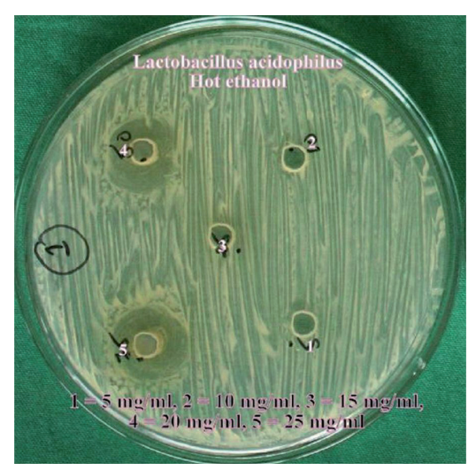
Fig. 4. Phytochemical analysis of orange peel extract.

alkaloids, carbohydrates and glycosides, tannins and phenolics, saponins and flavonoids. Triterpenoids were only present in ethanolic extract.