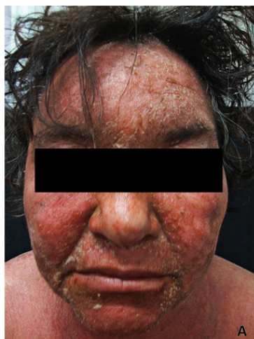
Figure 1a: A 51-year old woman with AGEP caused by etanercept. The patient presented edematous erythema on the face with perioral pustules.