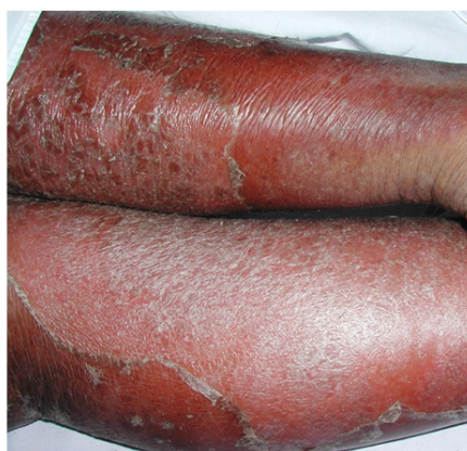
Figure 1b: The lesions progressed to trunk and limbs. A diffuse erythema and swelling, showing a characteristic postpustular desquamation was observed after few days in the lower limbs.

eosinophils 6% (0-10%) and erythrocyte sedimentation rate 70 mm/hour (0-30 mm/hr).