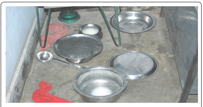
Figure 4: Close view of steel utensils found inside the room containing food material ( Rabdee ).

sealed injection vials of REGLAN, AMICIN, dextrose bottles and many packed and unused syringes were found. The utensils in the kitchen were found clean and unused (Figure 1 and Figure 2).