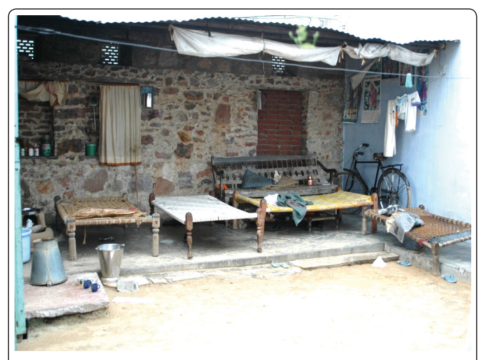
Figure 1: Open tin shade of the house showing cots on which body of deceased were reportedly found. No sign of vomit was detected.

1. About the spot: Some steel utensils were found in a room of the house, two of them contain food material ( Rabdee ). One of them having characteristics smell of insecticide. No vomit stains were detected in the premises of the house. No wrapper/container of any insecticide or any poisonous material was detected. In one room of the house, significant amount of strips of medicines,