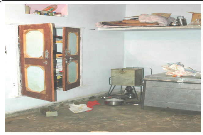
Figure 3: Photograph showing utensils and medicines inside the room.