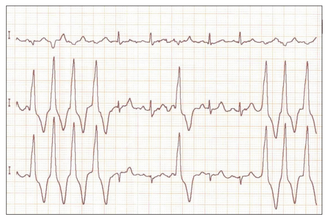
Figure 1: Electrocardiogram showing standard Leads I, II, and III: Frequent ectopic ventricular beats with short runs of the nonsustained ventricular tachycardia

Transthoracic echocardiography revealed only a mild mitral valve prolapse with mild mitral regurgitation.