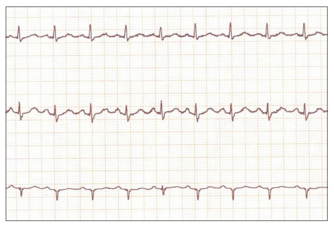
Figure 3: Electrocardiogram showing standard Leads I, II, and III: Regular sinus rhythm just after conversion with amiodarone

VT in a patient with mild mitral valve prolapse-induced by single bee sting in the absence of anaphylaxis. Bee venom as a metabolic insult and resultant autonomic overactivity probably induced tachyarrhythmia in this case.