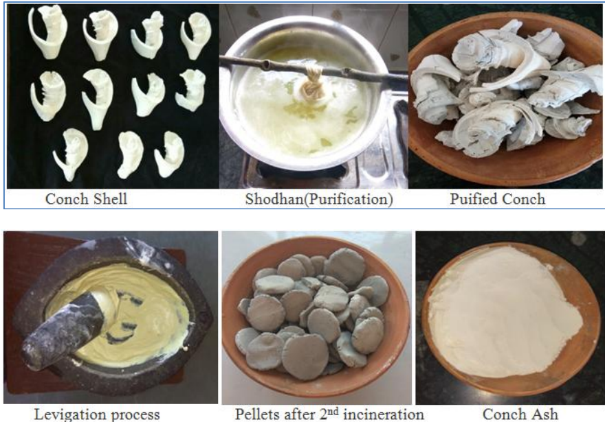
ation process Pellets after 2<sup>nd</sup> incineration Conch Asl Fig-1: Different samples and processes of Preparation of conch Ash

its Kapadmitti (seal) was removed. Counch pieces were taken out, weighed (594 gm) and powdered in a stone mortar till fineness was attained. The powder was again triturated with lemon manually for 8 hours. When semi-solid mass was formed, Chakrika (pellets) were made. These pellets were allowed to dry for 12 hours. Pellets were weighed and again subjected to incineration, by previously mentioned mannar. The process was repeated twice in the same way. After 3<sup>rd</sup> incineration, pellets were weighed and subjected to trituration without adding any lemon juice, to get a fine powder of Shankha Bhasma (517gms), which is finished formulation. The A.F.I part I, advises to give only two Putas for the Shankha Marana [7]. In the present study, three Shikhrakar puta was given for the conch. After the third put, the Bhasma became finer and white.