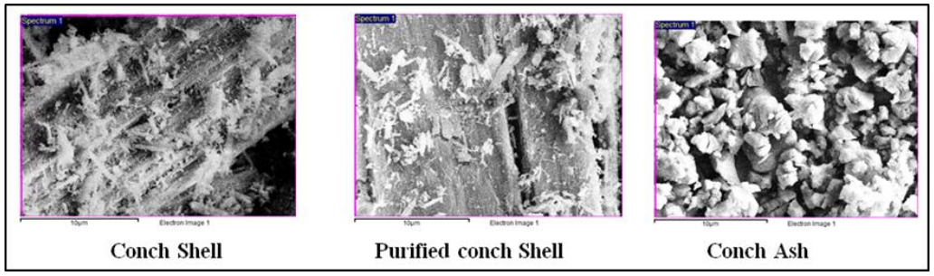
Fig 3: Surface Microphotograph (SEM) of all samples of Conch