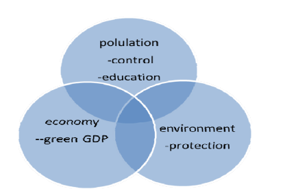
Figure 3. Water pricing and sustainability

Addressing China's water shortage requires a national sustainability strategy, a systems approach rather than a sporadic and piecemeal