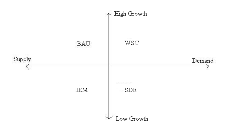
Figure 2. Tianjin water scenarios 2030

Given Tianjin's circumstances, a single end forecast would not suffice to show the complexity of the city's water situation. A number of different scenarios (Figure 2) can accomplish this. The year 2030 is set as the target for the four different ends. Uncertainties are trends that are currently very difficult to predict, such as improvements in water resource development, efficiency and productivity, institutional policies, residents' behaviors and impact of global warming. The unchanged parameters include economic growth, population growth, living standards improvement, and so on.