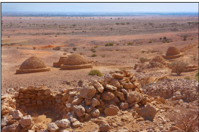
Figure 2. Al Ain: Hafeet tombs