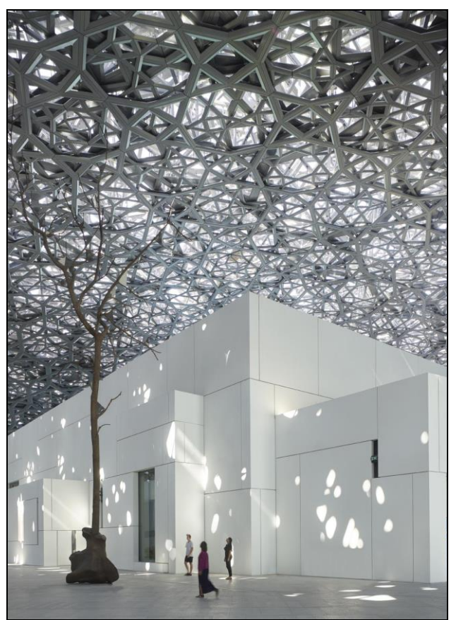
Figure 5. "Rain of light" effect under the Louvre Abu Dhabi's dome, inspired by the Al Ain Oasis (© Giuseppe Penone, Abu Dhabi Department of Culture and Tourism, Photography: Roland Halbe)