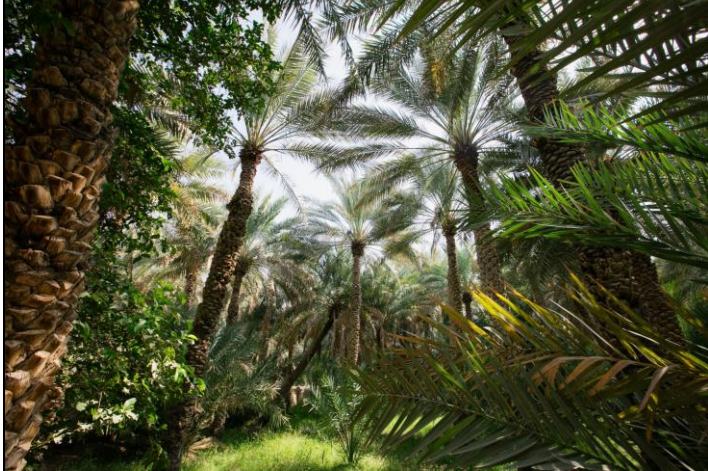
Figure 6. Sunlight shining through the palm trees at the Al Ain Oasis

The virtues of cultural investment for socioeconomic development constitute a truism that is empirically observable in destinations worldwide. However, a macroeconomic study by Du et al. (2016) serves as a warning that tourism does not grow to success in is olation, as it is dependent on entrepreneurial, innovative, creative stakeholders in the full range of civil society. Fragilities indeed lay in the lack