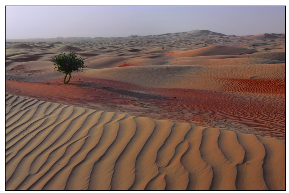
Figure 4. Al Ain red sand dunes