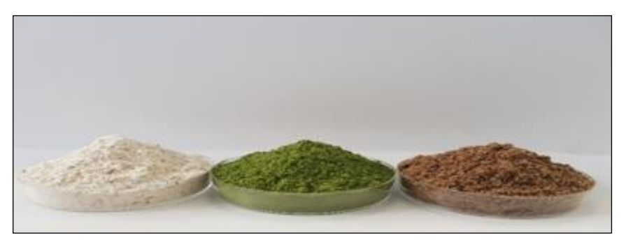
Figure 1. Whole wheat flour, alfalfa concentrate flour and defatted flaxseed flour.

Three samples of mixtures from wheat flour, with different proportions of partially defatted flaxseed flour and alfalfa concentrate were obtained. The types of flour mixtures used in this study are presented in Table 1.