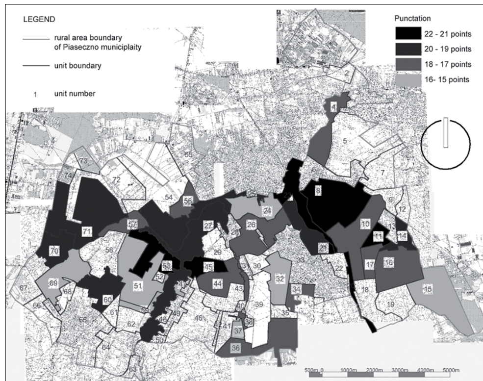
FIGURE 3. Spatial-landscape units with high landscape values for ecotourism aspect (own elaboration based on Kulczyk and Lewandowski (2006) method (own research))