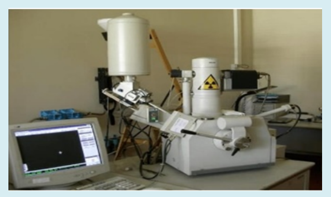
Figure 2: Scanning Electron Microscope (SEM).

Additives are integral components of lubricating oils, serving to enhance their tribological characteristics by reducing friction, preventing wear, and maintaining thermal stability. However, the effectiveness of these additives depends significantly on their dispersibility within the lubricant matrix. Poor dispersibility can result in uneven distribution of additives, leading to localized areas of inadequate lubrication and compromised performance of mechanical systems. Thus, optimizing dispersibility is crucial for maximizing the benefits of additives in lubricating oils. In this critical review, we delve into the multifaceted impact of additives on the tribological characteristics of lubricating oils, with a particular emphasis on the importance of dispersibility. Through a comprehensive analysis, we explore how additives influence friction reduction, wear protection, and thermal stability, considering their interactions within the lubricant matrix. Furthermore, we examine strategies to enhance dispersibility, including formulation techniques, blending processes, and advancements in nanoparticle technology. By elucidating the intricate relationship between additives and tribological performance, this review aims to provide valuable insights for researchers and industry professionals seeking to optimize lubricant formulations and improve the efficiency and longevity of mechanical systems.