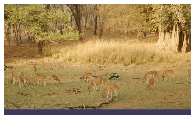
Herd of spotted deer and peacocks in a clearing

• Water volume within the KWLS, estimated by adding the cumulative surface area of a small lake known as Pangara (3.26 km<sup>2</sup>) and a small additional artificial reservoir retained by a masonry dam located at Kalyanpura (2.1 km<sup>2</sup>). This total volume was multiplied by canal irrigation water costs yielded a value of INR 0.16 million. If consumed within a year, this also represents an annual benefit value.