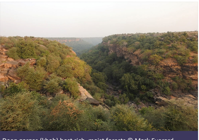
Deep gorges (khoh) host rich, moist forests

Vegetative cover elsewhere in KWLS is relatively sparse. Dhonk ( Anogeissus pendula ) is the dominant tree, constituting 80 per cent of vegetation cover. Forests adjacent to villages and the forest boundary are reduced to stunted shrubs through anthropogenic pressures (Forest Department, Rajasthan, 2015; Thorat & Gurjjer, 2010). Larger fauna includes predators such as Leopard ( Panthera pardus ) and herbivorous prey populations including various deer species. For management