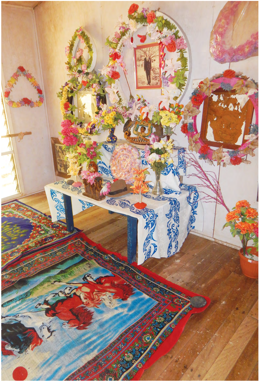
Figure 14.4: The shrine to Paliau in the room in which he died, 2015.