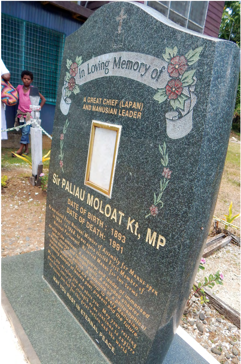
Figure 14.2: Paliau's grave in Lipan-Mok village, Baluan Island, 2015.