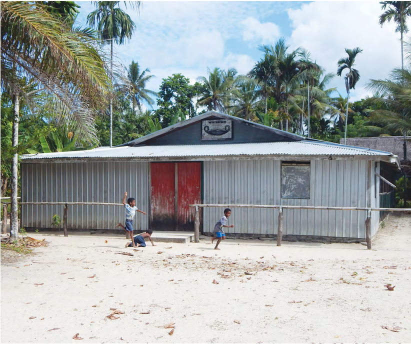
Figure 14.1: The Wind Nation meeting house in the centre of Pere village, 2015.