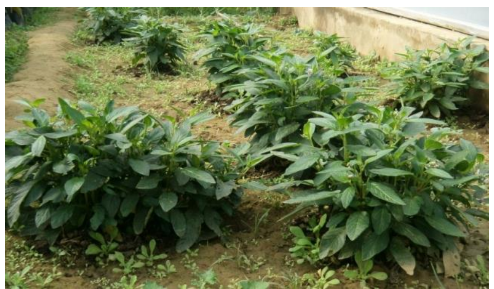
Figure 2. Crop growth and adaptation under subtropics (ICAR-CISH, Lucknow, India).

Keeping in view the potentiality of the crop that might undergo adaptability in a subtropical environment, Pepino cuttings were planted at ICAR-Central Institute for Subtropical Horticulture, Rehmankhera, Lucknow, Uttar Pradesh, India during winter months (October, 2014). The plant survived during harsh summer conditions of 2015 (Fig. 2). The survived plants were multiplied and planted in the field conditions for performance evaluation. Fruit harvest started from March onwards and continued until the month of May. The variations in different parameters viz. , fruits weight (150–350 g), yield (4–5 kg per plant), moisture content (93.6%), Vitamin C (37.17 mg per 100 g), Acidity (0.13–0.14 %) and TSS (4.9–5.5 %) was recorded (Kumar 2016).