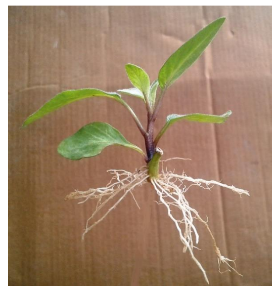
Figure 3. Profuse rooting of cutting.