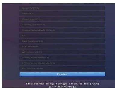
Fig 2: Final Result Page