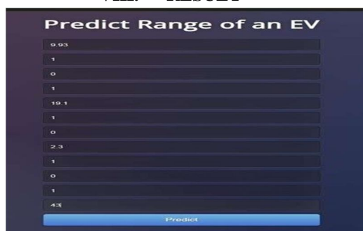
Fig 1: Web App UI