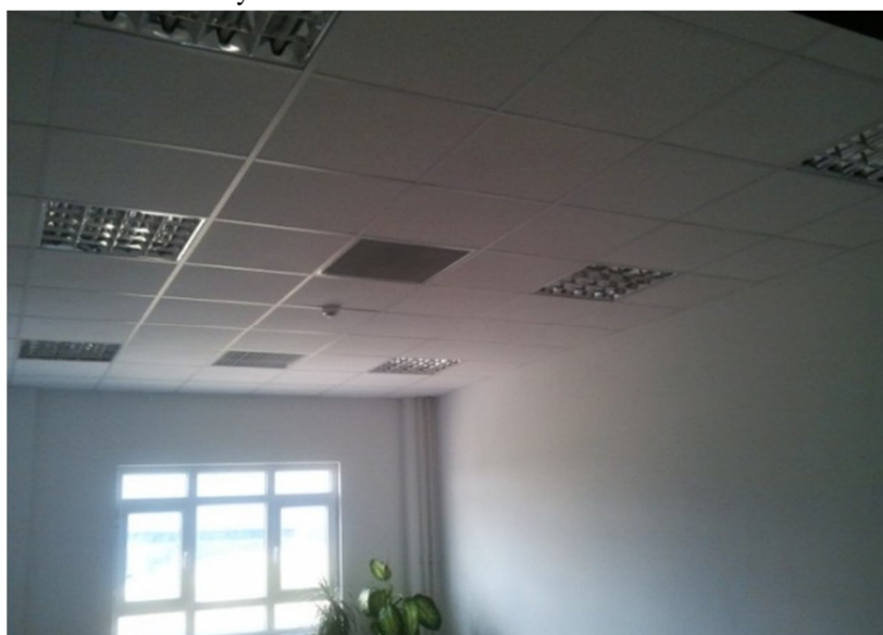
Fig 2. Fluorescent Luminaire Layout for Room 1 and Room 2

The participants, who participated in the survey study voluntarily in the experimental rooms, were left alone in the rooms for 10 minutes each to get used to the rooms, and then the participants were given the Visual Burdon Tests, which lasted for about 2 minutes. The Burdon test is a test for finding a specific letter or image without errors in mixed letters and visual sequences, which is used to measure the attention and perception level in children and young people. It has been determined in the literature research that the Burdon tests are still being used and it has been decided to use them in this study as well. Tests in rooms 1 and 2 with 100% work and room 3 with 75% work were evaluated together. A different Burdon test for Room 3 was also given to the participants for the 100% and 50% levels. After the completion of these tests, the participants were asked to fill in a second survey that determined their psychological approaches to the rooms they were in.