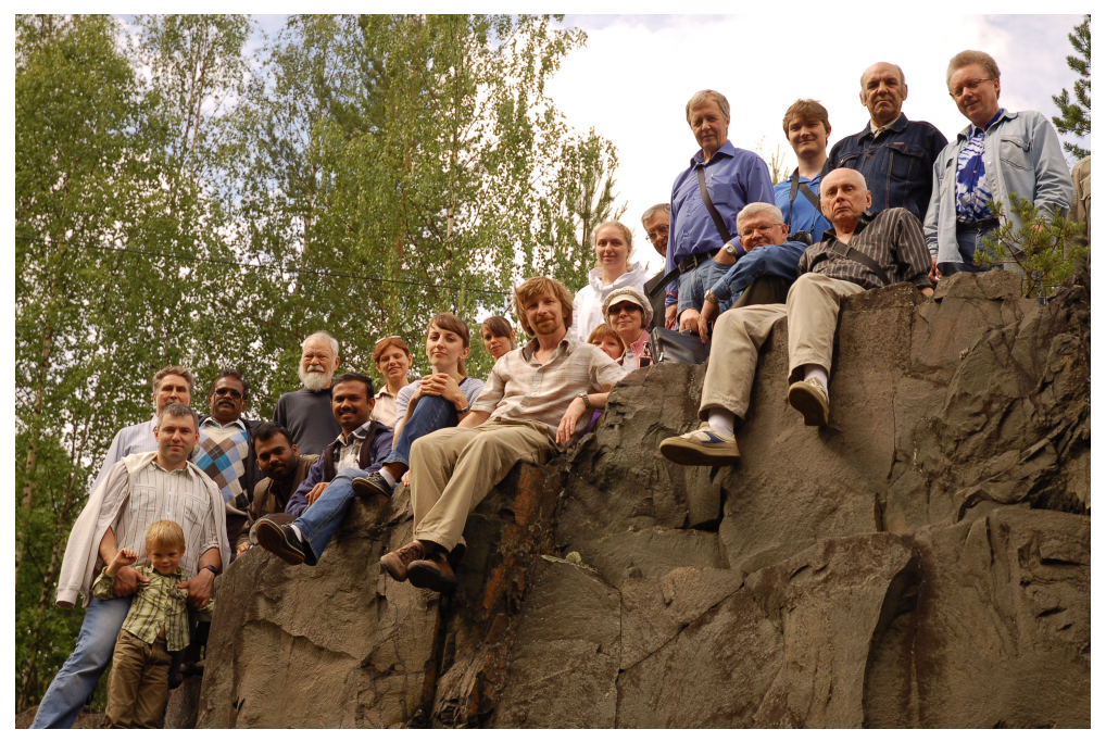
Participants of the VII conference on an excursion

In 2014, international organizing committee was represented by 15 people, with three Associate Members of the Russian Academy of Sciences. More than 60 people participated in the Conference: among them 25 PhDs, 15 Candidates, 14 postgraduate students and 3 students. Participants of the Conference were able to publish short presentations of their reports (up to five pages) in the "Conference Materials" section; Conference materials are downloaded to the Russian Science Citation Index database. Additional information can be found at http://mf.karelia.ru/piccana/.