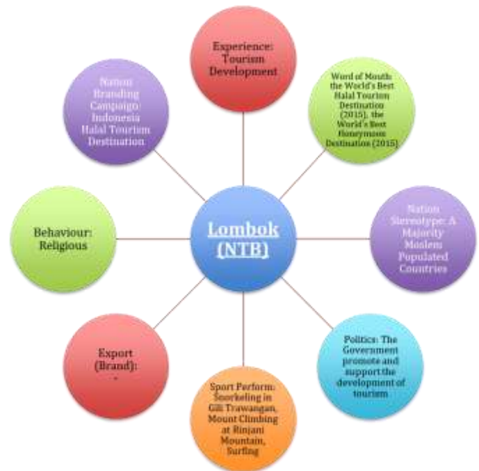
Fig. 6: "Diagram of Lombok Island Image Formation Factors"