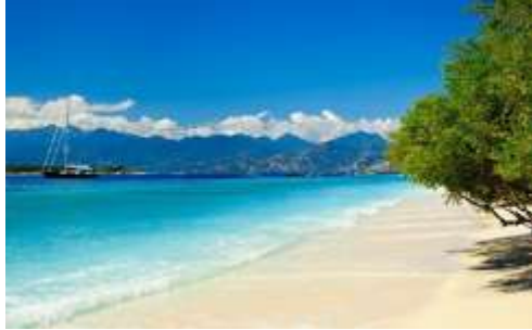
Fig. 2: "Picture of Senggigi Beach"

Lombok as one of the islands in Indonesia is well known for its natural attraction. There are several tourism sites we can find in Lombok. Some of them are coastal tourism, the beauty of Lombok's underwater, mountain climbing, and historical tour. Tourism site in Lombok is not less attracting than Bali which has been the most prominent destinations of Indonesian tourism. There are some attractive destinations in Lombok such as Senggigi Beach, Gili Trawangan and Rinjani Mountain.