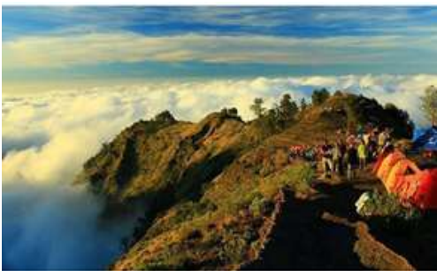
Fig. 4 : "Picture of Rinjani Mountain"

Indonesian government saw Lombok tourism potential and want to develop it towards halal tourism to attract more foreign tourists, especially Moslem populated countries. This effort is supported by the Indonesian government with the acceleration of development on the island of Lombok. The effort made Lombok in 2015 is awarded with two awards ( the 1st World's Best Halal Honeymoon Destination and the 1st