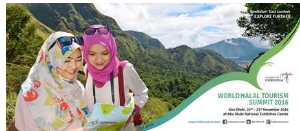
Fig .5: "Picture of Lombok Island Voting Campaign for World Halal Tourism Summit 2016" (www.indonesia.travel, 2015)

Branding the Lombok Island as halal tourism destination cannot be found in the form of pictures or logos. But there is one form of branding using an image only to call for voting at the World Halal Tourism Award 2016.