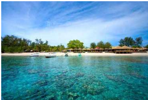
Fig .3: "Picture of Gili Trawangan"