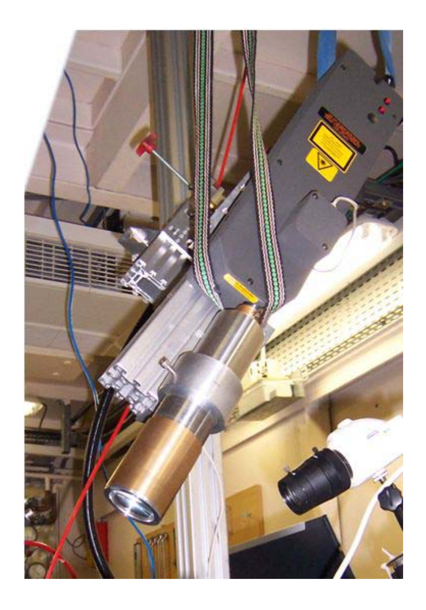
Figure S2 : The Raman probe (RP in figure S1) equipped with the long distance optical expander (the optical head) allowing a long (150 mm) working distance.