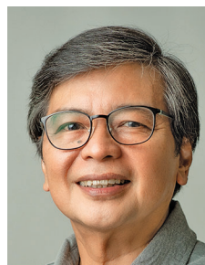
Jose Maria Balmaceda