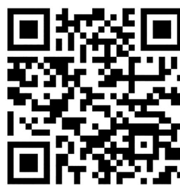
GRAID Donation (FIMU)

GRAID has been supported by donations from individual mathematicians and mathematical institutions worldwide. Individual mathematicians have donated their personal funds and prize money for mathematical awards to GRAID through the Friends of the IMU (FIMU) and CIMPA, members of the AMS support GRAID as an option in the membership form, and CIMPA also supports GRAID. There has even been small grassroots initiative to support GRAID by running (runForGRAID). 2 It has been through a combination of all these efforts that these research experiences for students have been possible. Thank you to all the donors!