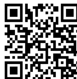
GRAID Donation (CIMPA)