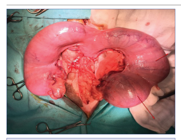
Fig 4. Oedema and color change in the right uterine corn which is a prolapsed ( arrows )

of this the patient were transferred to the our hospital department of surgery for cystopexy and uteropexy procedures since the previously rejected urinary bladder was still partially prolapsed and could be easily seen externally. Urinary bladder was rejected during surgery and returned to its anatomical position were performed according to Mc Namara et al. [6]. After consultation, the bladder was reported to have regressed one day following the subsequent examinations revealed that the dog had fully recovered.