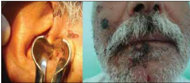
Figure 1. Vesicular skin eruptions on the right auricula, external ear canal and the patient's face before therapy.

Patient's history indicated that all complains started five days ago. Past medical history revealed untreated chickenpox infection at the age of 62 and suffering chronic otitis media for almost 15 years with several treatment attempts. Physical examination showed moderate overall condition, vesicular skin eruptions on the right auricula, external ear canal, preauricular region and right side of face (Figure 1, 2). Numbness, decreased taste sensation and movement restrictions on the right side of tongue have been detected. A painful, hyperemic and erythematous lesion progress along with the trace of nervus lingualis which does not cross middle line was observed on the right half of tongue (Figure 2). Physical examination of cranial nerves suggested involvement of lingual branch of 7 th cranial nerve due to sensory numbness on the tongue and involvement of 12 th cranial nerve due to numbness on motor movements. Otoscopic examination showed bilateral perforation in central portion of tympanic membranes. Facial paralysis is evaluated as