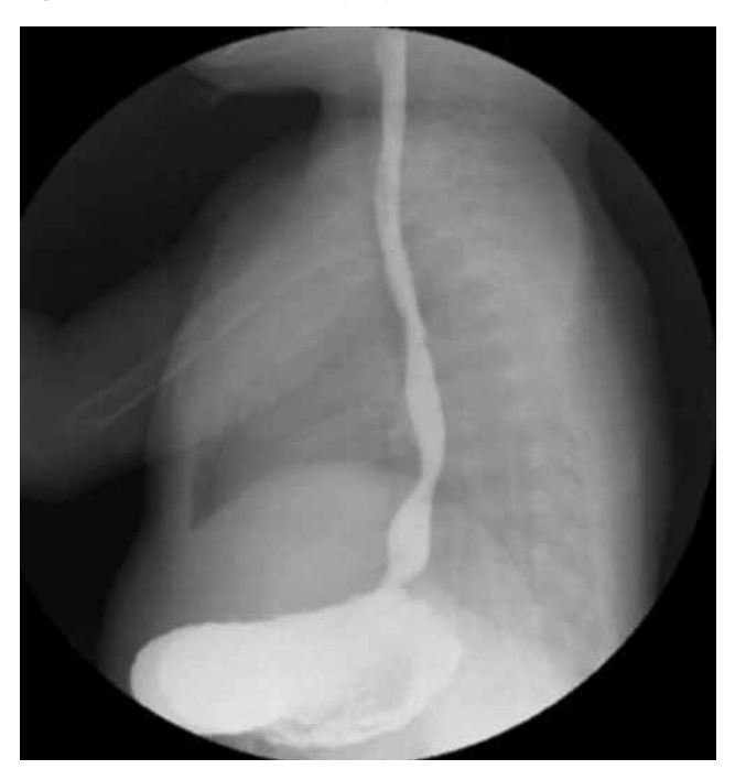
Figure 4. Barium esophagus-stomach radiograph six months after the endoscopic dilatations

Despite the risk of this complication, when consideration is given to the complications which may develop in patients undergoing surgical resection (operation risk, short esophagus, gastroesophageal reflux stricture, the need for postoperative anti-reflux operation), conservative dilatation methods should be considered (7). While some studies have reported successful conservative treatment, there are a limited number of cases with high rates of complications. A greater number of reports have stated that relatively good results have been obtained and emphasized that it is certainly a safer option (1-7). In the reported studies, dilatation was