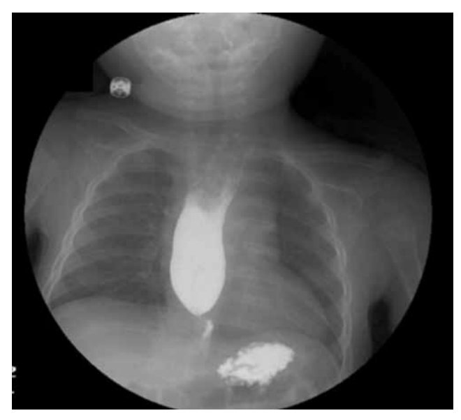
Figure 1. Narrowness in the distal esophagus and widening in the proximal seen on barium radiograph

Surgery, such as resection was formerly suggested as the first therapeutic strategy for pediatric cases with stenosis (5). In these cases, hospital stay would be prolonged and thoracotomy surgery might be necessary.