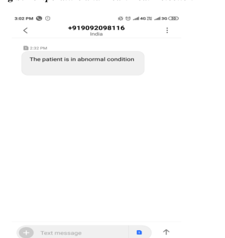
Fig c: Text Message Received By the Doctor of the Patient during Abnormal Condition