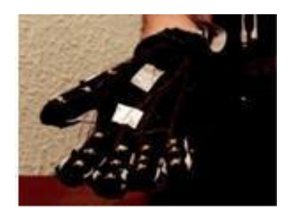
Figure 1. Glove Sensor