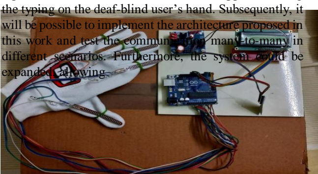
Fig. 4. Glove Sensor's experimental set-up

presented a scenario, a conference for deaf and blind people, in which a many-to-many communication is required and then we discussed a possible architecture, exploiting the potentiality of tuple centre as communication and coordination media. As future work, it will be interesting to equip the glove with output sensors (e.g. electromagnetic micro-pulse) can able to reproduce the text written in the Android app, simulating