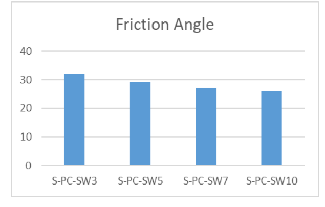
Figure 4 Friction angle of mixes varying SW

The friction angle is decreased with increasing in sawdust percentage.