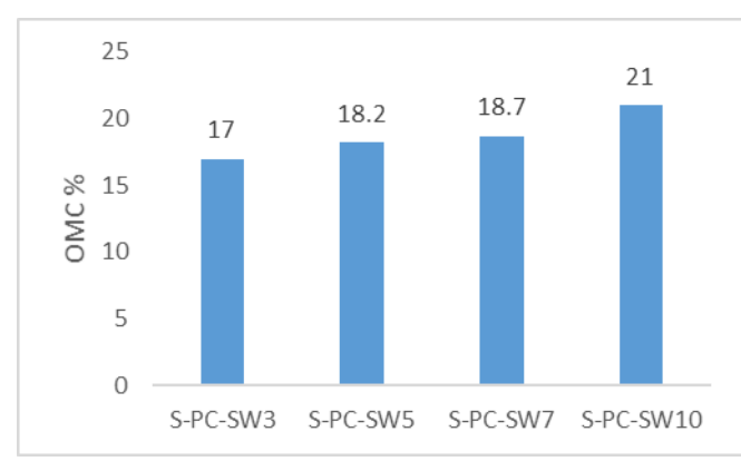
Figure 2 OMC values of mixes

Figure 2 shows that increasing in SW percentage increases the OMC values.