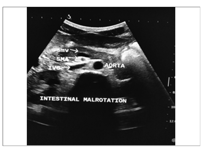
Figure 1: Ultrasound of abdomen showing location of super mesenteric vein in front of superior mesenteric artery.

Midgut malrotation may lead to potential life-threatening complications. Therefore, patients of adolescent or adult age with any non-specific symptoms of abdominal pain should be examined for abnormal malrotation of bowel loops and subsequently managed with early surgical treatment.<sup>10</sup>