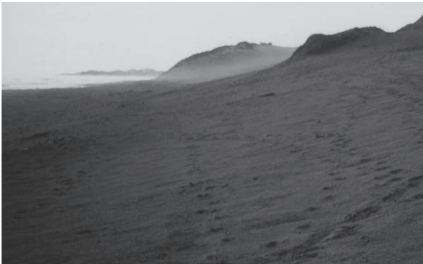
Figure 3. Sigatoka Sand Dune in south Viti Levu, west view along dunes.