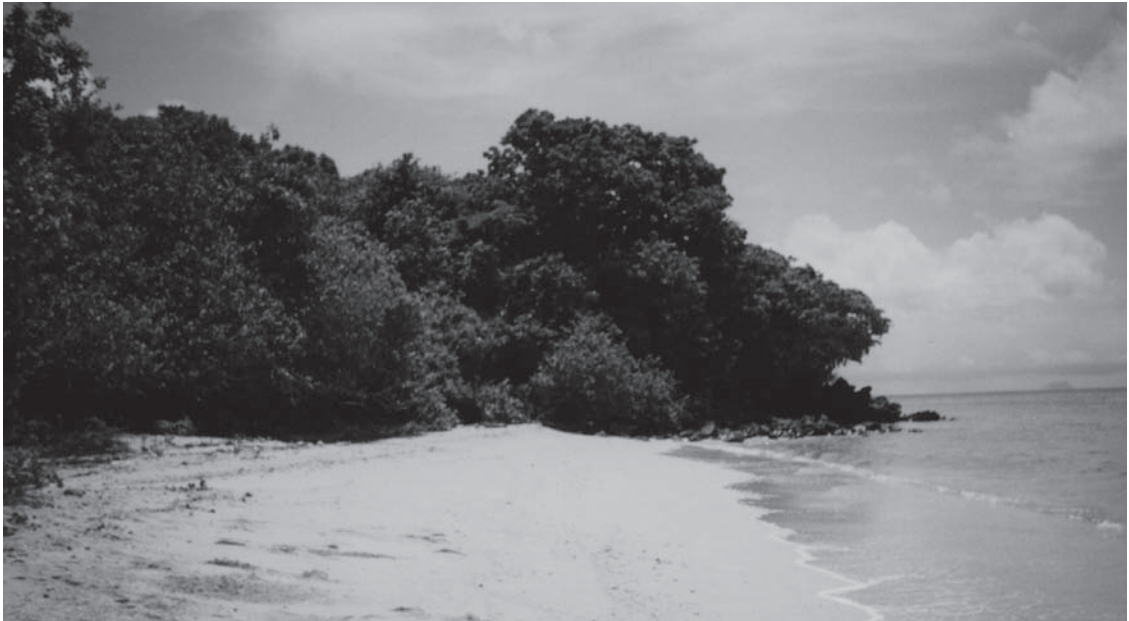
Figure 6. The Vutuna headland (west view) on Mago Island. The Votua Lapita site lies behind the beach berm beside the Tokelau Stream.

Another site with early paddle-impressed wares was on the small lagoonal island of Ugaga (Figure 8). At this site, the transition from late Lapita to the middle phase of Fijian prehistory could be investigated.