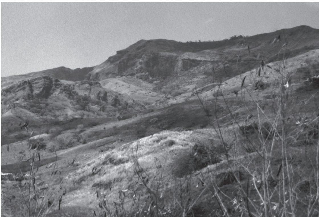
Figure 2. View of the landscape inland from the Sigatoka Sand Dunes.