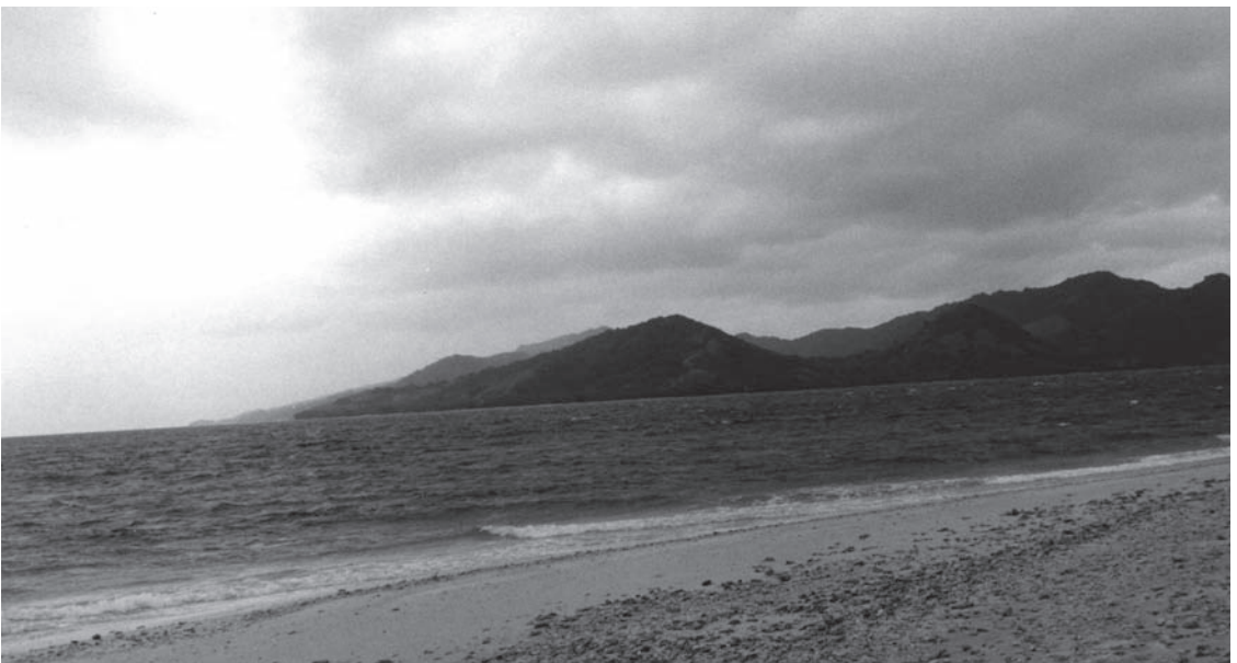
Figure 7. Beqa Island viewed from Ugaga Island.