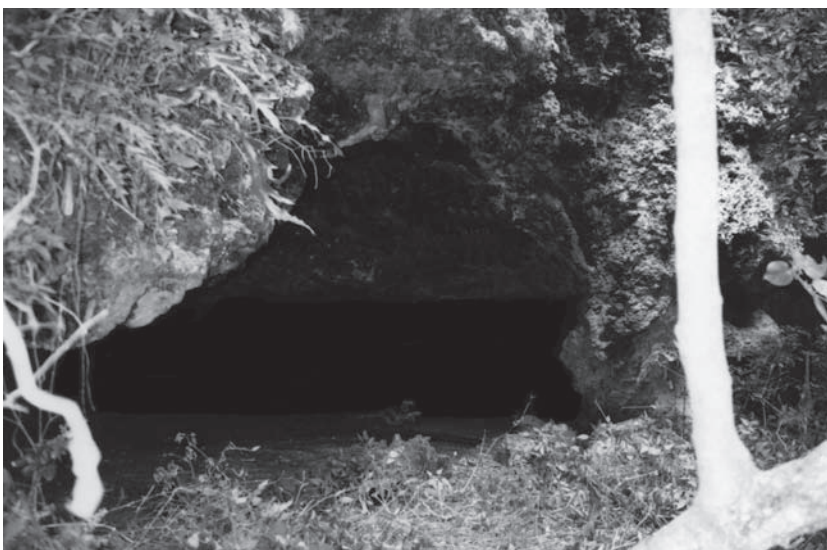
Figure 4. Malaqereqere rock shelter prior to excavation.