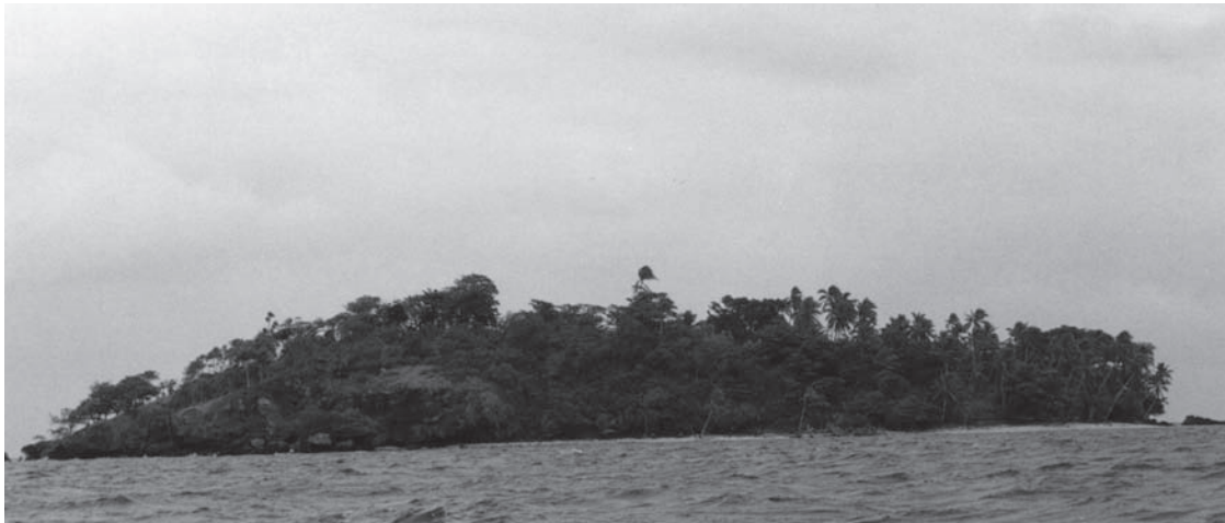
Figure 8. Ugaga Island in the Beqa Lagoon.