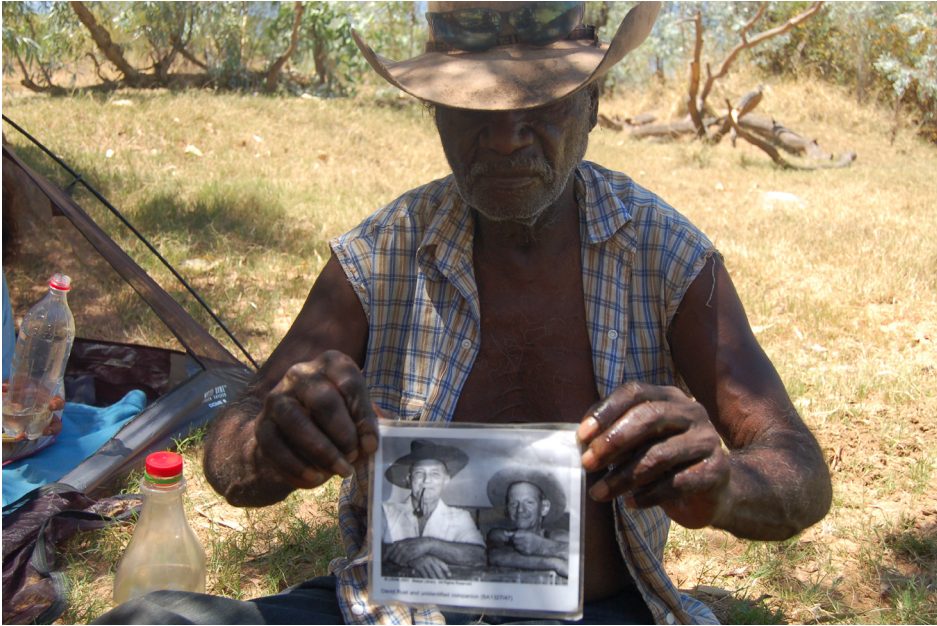
Figure 5.3 Gudurr with photo of Rust and Salmond 2008