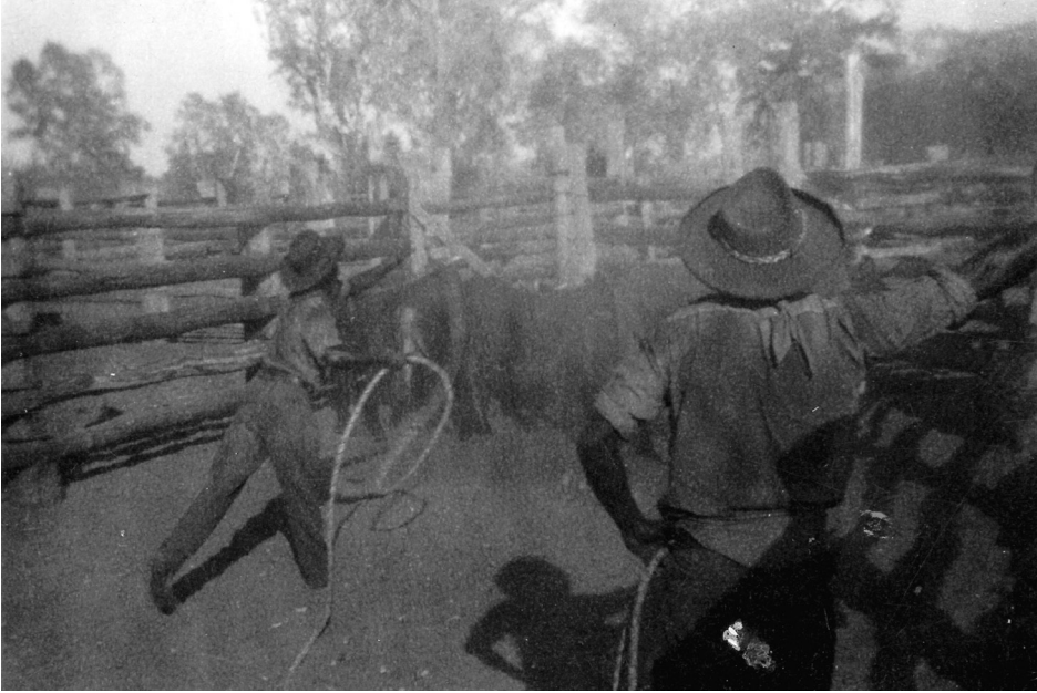
Figure 5.4 Roping cattle at Karunji Station ca. 1940-60

There were some positive aspects for Aboriginal people within the system of rations for labour, even when that system was underpinned by coercive practices, including racially discriminatory legislation that made it an offence for them to ‘abscond’ from their employment. Droving cattle to Wyndham meant that stockmen were constantly travelling over and ‘look’em country’ and could meet up with neighbours for ceremony, since it seemed cattlemen and police did not try to suppress the operation of Wurnan ceremonies. There are references in the records to people regularly going ‘walkabout’ and this was an accepted part of the station routine. For some Aboriginal men and women their relationships with violent whitefellas such as Salmond, and with marginal men such as Sahanna, provided a conduit to a set of goods (particularly red cloth), which replicated some of the ritual power associated with the red ochre that had been traded from this direction since time immemorial. Allanbra also noted that the sandalwood root they carted to Wyndham wharf had a strong red colour when it was cleaned, and that it returned as ‘medicine’, which seemed to avail it of the kinds of power associated with ritual healers.