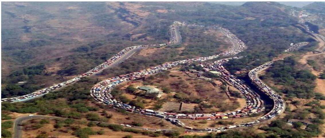
Fig no.1 Top View of Bhor Ghat

For the study purpose bhorghat has been selected. The elevation of bhorghat is 622 metres and 2041ft in depth. It is located between khopoli and khandala.