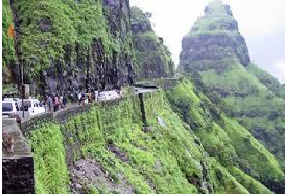
Fig no.2 Curve Section of Bhor Ghat