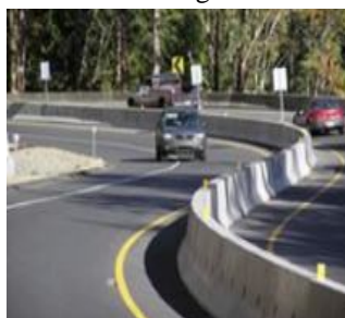
Fig. no 5