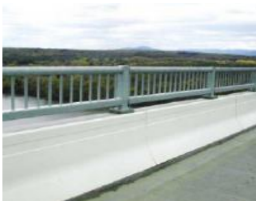
Fig. no 6