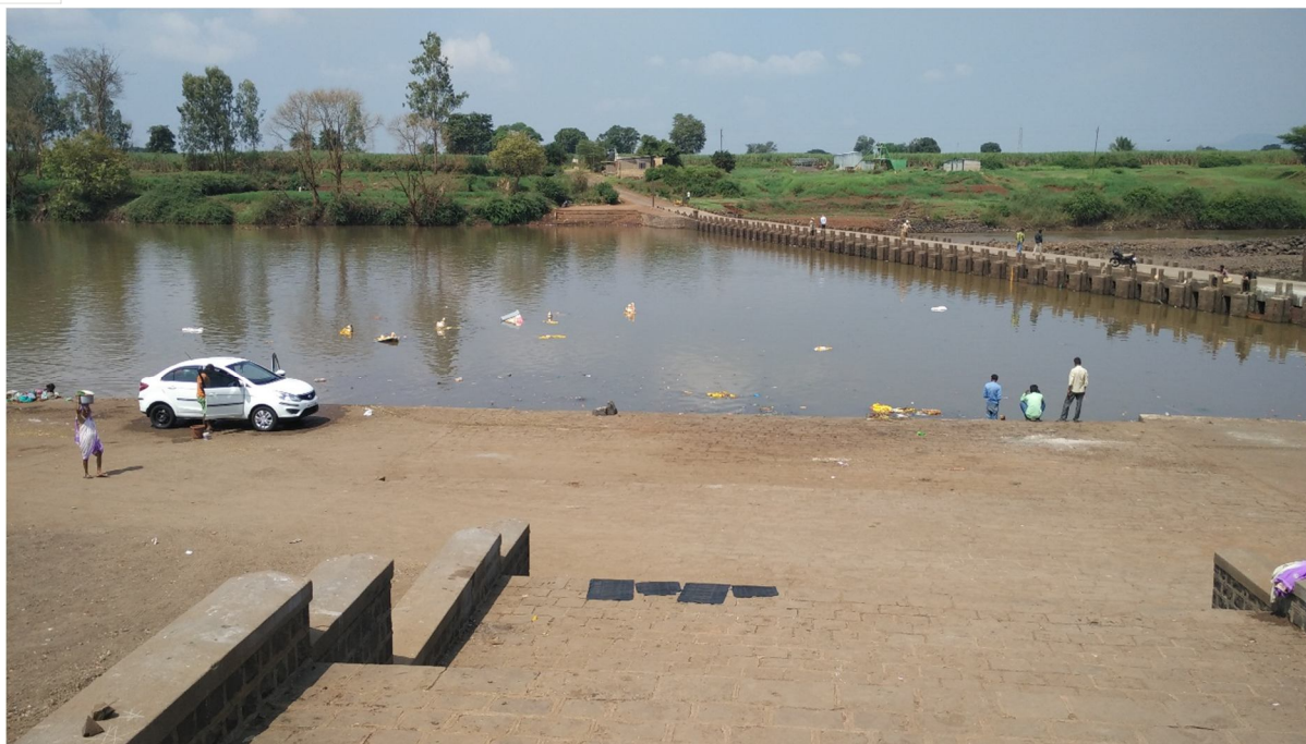
Figure 2. Rajaram Bandhara Kolhapur district Maharashtra India