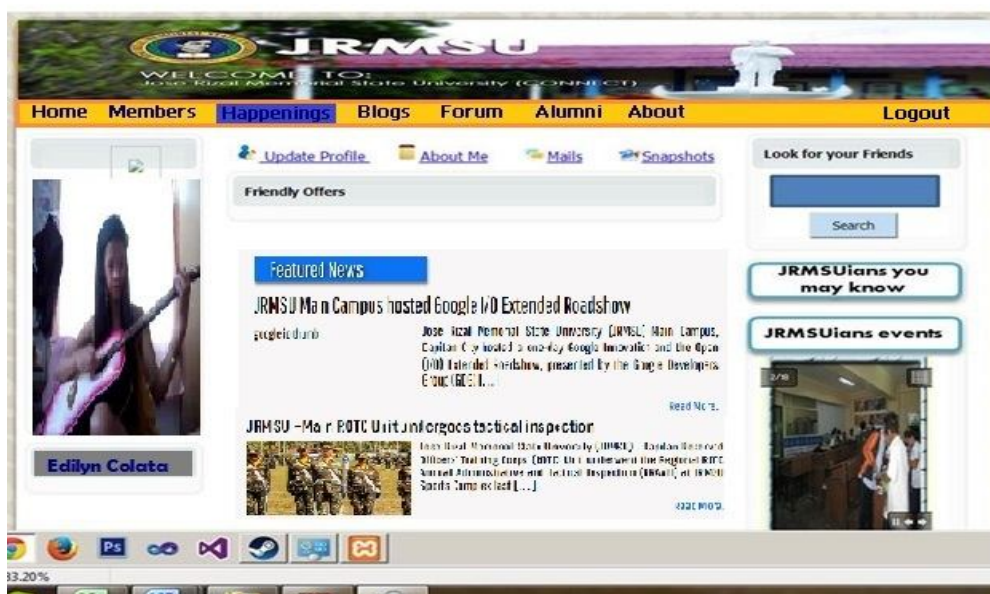
Fig 3. Sample User Interface

Figure 3 is the user's interface used by the JRMSU students/alumni in staying connected with other graduates and to keep them updated on the different happenings inside the JRMSU environment. The program interface is composed of four tabs such as home, happenings, profile and log-out tab. Home tab shows the shout-outs of the registered user which is also shown with the other users. It serves as the current status of the user. The happenings tab tells on the past events, present and upcoming activities. The user can also publish their own invitations which can be viewed by all members of the group. Profile tab consists of the information of each user. Pictures and photo albums can also be viewed on this tab as a compilation of the user's picture. Users can search on members