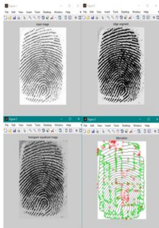
Fig.3. (a) Input image (b) Ridge segment (c) Histogram equalization (d) Bifurcations