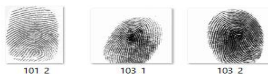
Fig.2. Fingerprint images obtained during Acquisition stage

This section describes the working of the proposed model of fingerprint authentication system using minutiae matching.