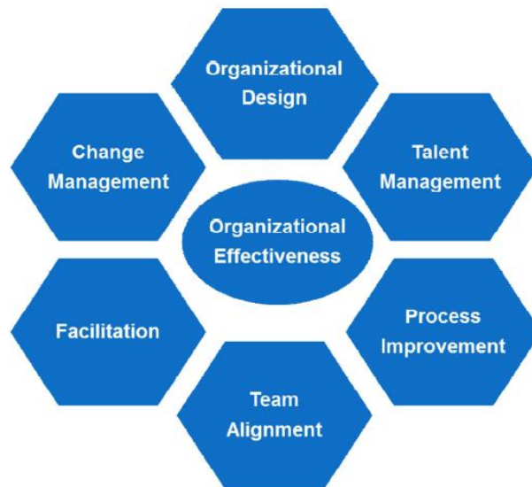
Fig -3: TQM & Organizational Effectiveness

Organizational effectiveness & Performance measurement are integral part of all management processes and traditionally has involved management accountants through the use of budgetary control and the development of financial indicators such as return on investment. It is clear that TQM acts as a platform for organizations to enhance their competitiveness still many organizations have been disappointed in the extent to which TQM has been associated with constant improvements in organizational effectiveness. Performance management systems are like cornerstone of human resource management (HRM) policies and are the basis for developing a systems oriented approach to organization effectiveness. Theoretically a performance management system provides a linkage between organizational and employee goals through a goal-setting process and subsequently links employee goal achievements to a variety of HR management decisions through a performance measurement process.